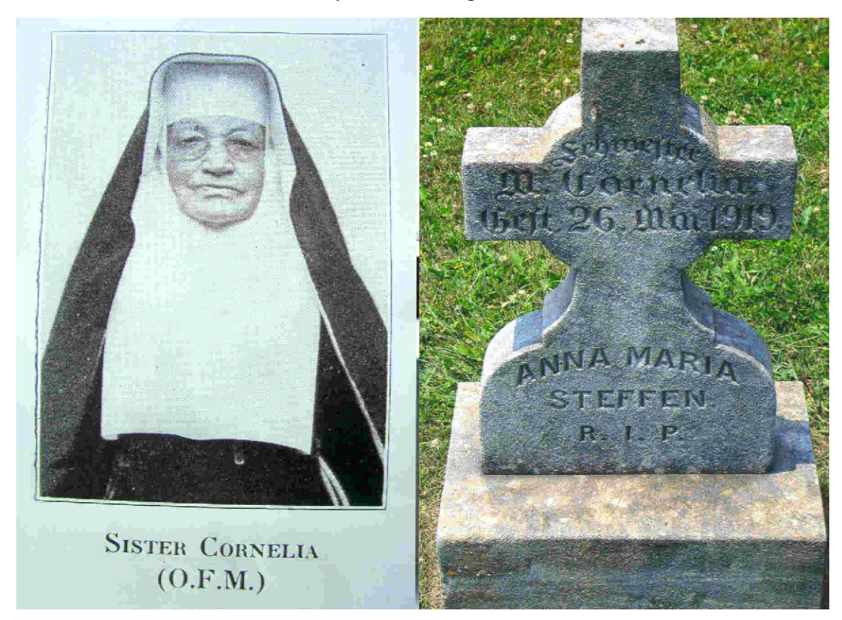
Photo - St. Mary Church Diamond Jubilee Celebration booklet – 1935 - Alexandria KY.